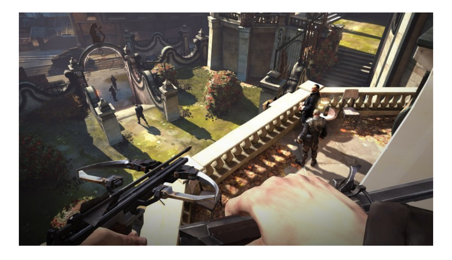
Download >>> <a href="http://bit.lv/2SMEUGa">http://bit.lv/2SMEUGa</a>